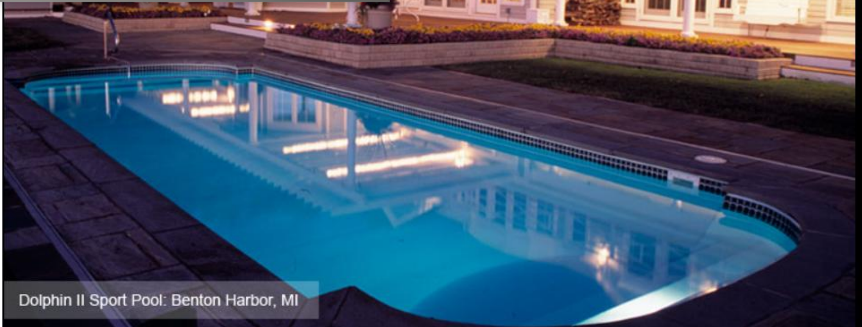
Dolphin II Sport Pool: Benton Harbor, MI